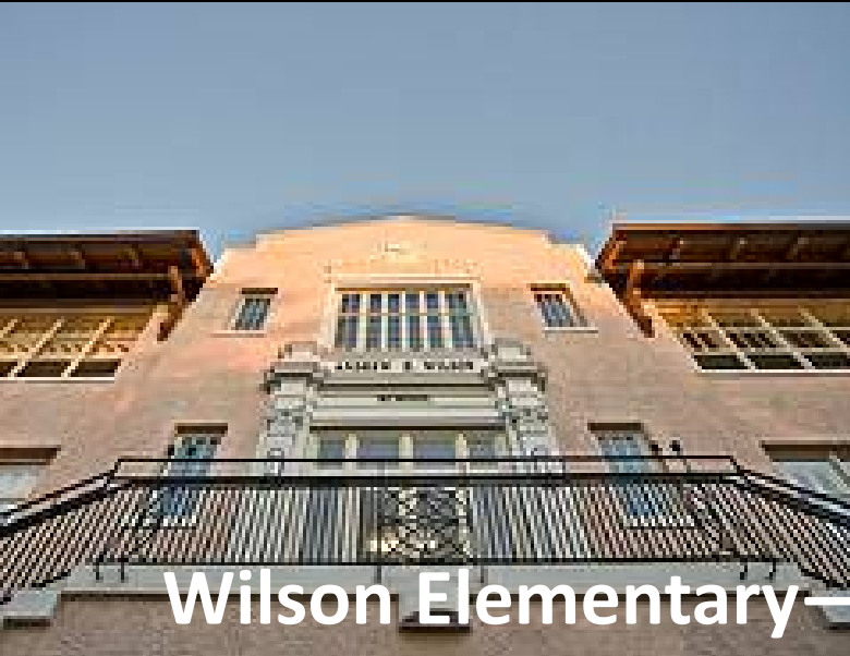
Wilson Elementary—Major Renovation