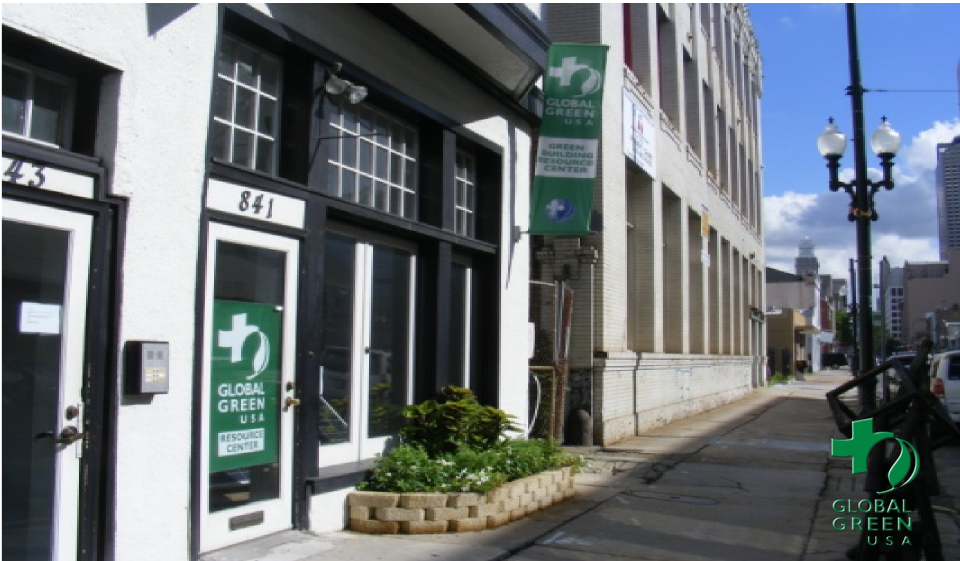
Downtown office s and Green Building Resource Center