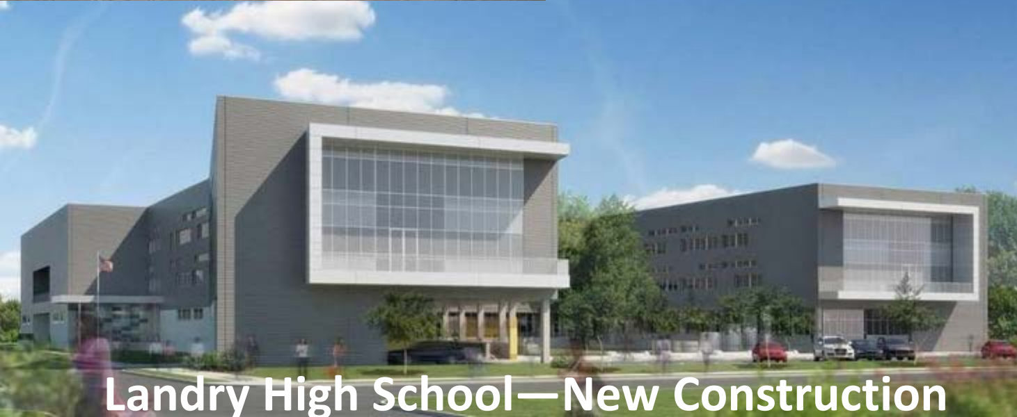
Landry High School—New Construction