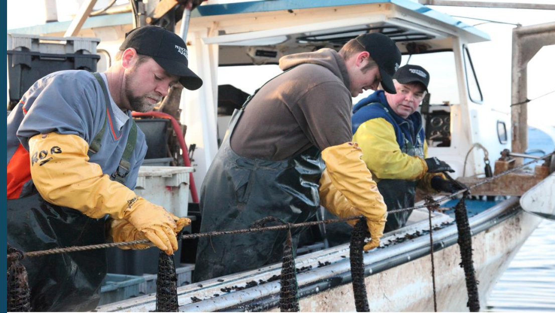
Mussel crew are tying new mussel socks filled with mussel seed onto a long line where they will grow for at least another year.