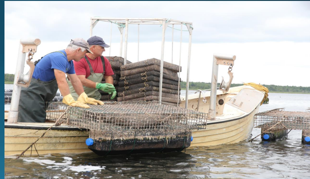
Oyster growers routinely flip their oyster cages out of the water to reduce biofouling.