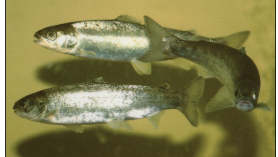
Atlantic salmon smolts.

A recent global analysis of the cumulative effects of human activities on the oceans found that ecosystems with the highest predicted cumulative impact scores are the hard and soft continental shelves and rocky reefs. Almost half of all coral reefs were categorized as experiencing medium-high to very high impacts. Shallow soft-bottom and pelagic deepwater ecosystems experienced the lowest impact because of the lower vulnerability of these ecosystems to most anthropogenic drivers. Overall, the results highlight the greater cumulative impact of human activities on coastal ecosystems (see map). This analysis does not, however, fully account for the emerging pressures in Arctic coastal ecosystems from the effects of climate change.