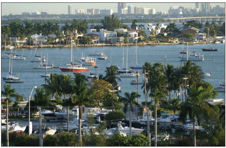
Miami, Florida, USA.