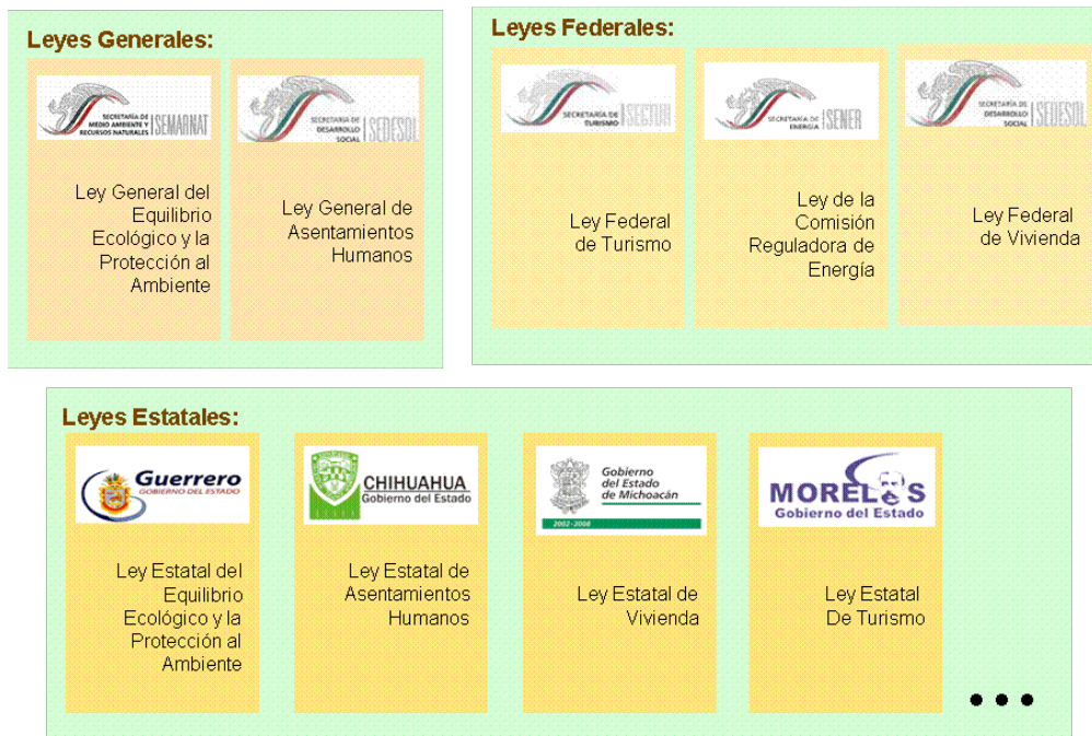
Figure 2. Legal framework to be amended to include green building criteria