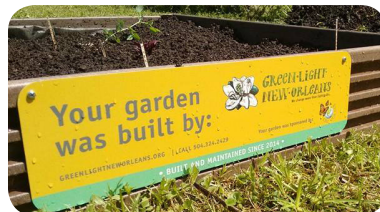
Green Light New Orleans

Many New Orleans residents live in neighborhoods that are swamped with highly processed convenience foods that are shipped thousands of miles. The goal of this project is to build backyard gardens to increase access to fresh food, reduce carbon dioxide (CO 2 ) emissions, and connect families to their food source. The project will also develop a methodology for calculating carbon offsets from residential gardening in New Orleans.