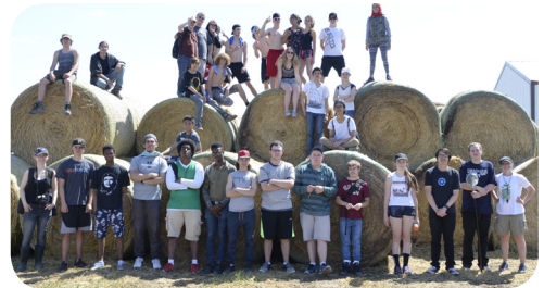
Students at Adopt a Rancher field day.