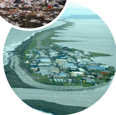
The Climate Foundation