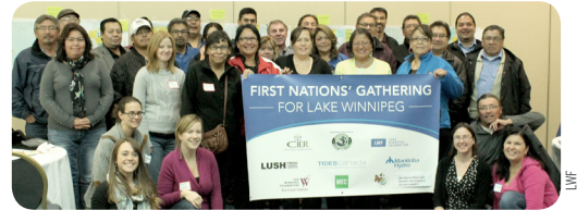
First Nation's gathering.

Because of excess phosphorus loading from human activity across this vast transboundary watershed, Lake Winnipeg is one of the most eutrophic large lakes in the world. This project will facilitate the inclusion of indigenous perspectives in developing solutions for the lake. Opportunities will be created for the emergence of a consensus-based, First Nation-led initiative to protect Lake Winnipeg.