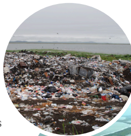
Open dump near Kivalina.

This project will address key public sanitation issues in Arctic North America through a pilot project co-developed with the municipal and tribal councils in Kivalina, Alaska. The project will: 1) create a shovel-ready project to provide improved biochar sanitation to the Arctic village of Kivalina; and 2) develop a model for improved sanitation for Arctic villages across North America.