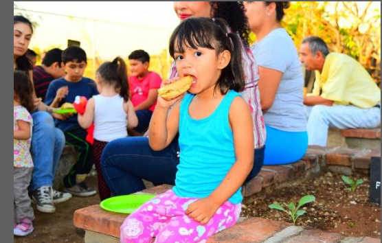
“Del Huerto a la Mesa”