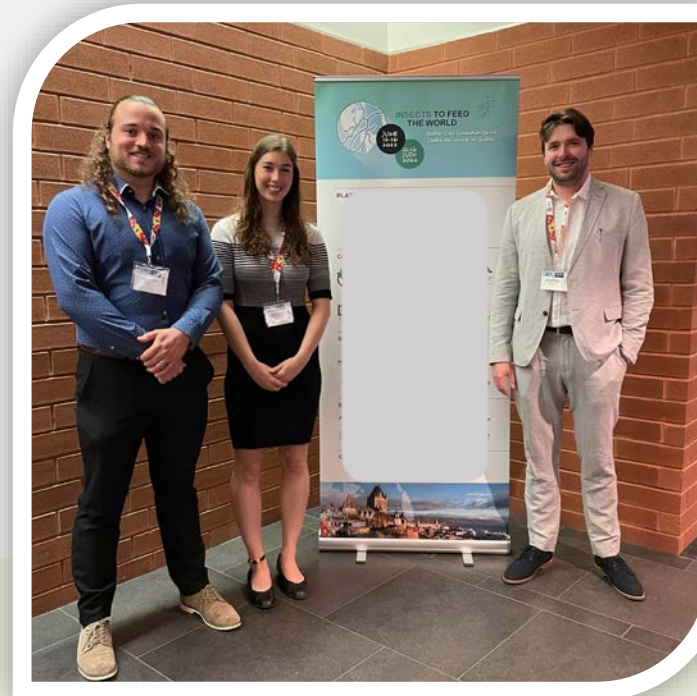
INSECTS TO FEED THE WORLD 2022

jean- michel.allardprus@couvoirscott.com