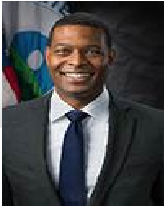
Michael S. Regan EPA Administrator