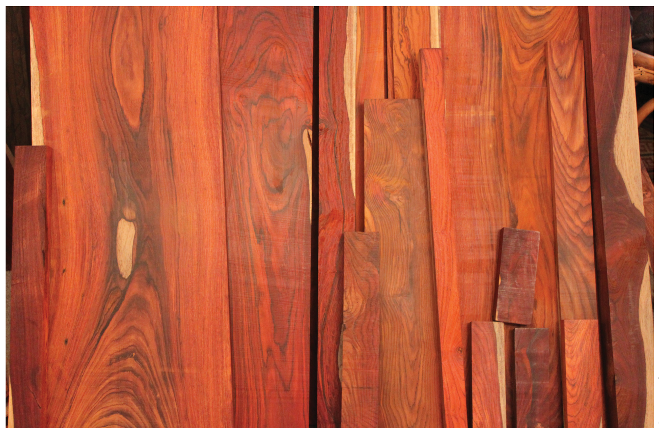
Rosewood (Dalbergia retusa)