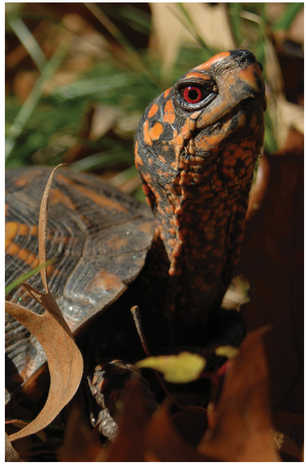
Eastern box turtle (Terrapene carolina)

In addition to the ESA, the Lacey Act makes it illegal to import, export, transport, sell, receive, acquire, or purchase, in interstate or foreign commerce, any fish or wildlife that was taken, possessed, transported, or sold in