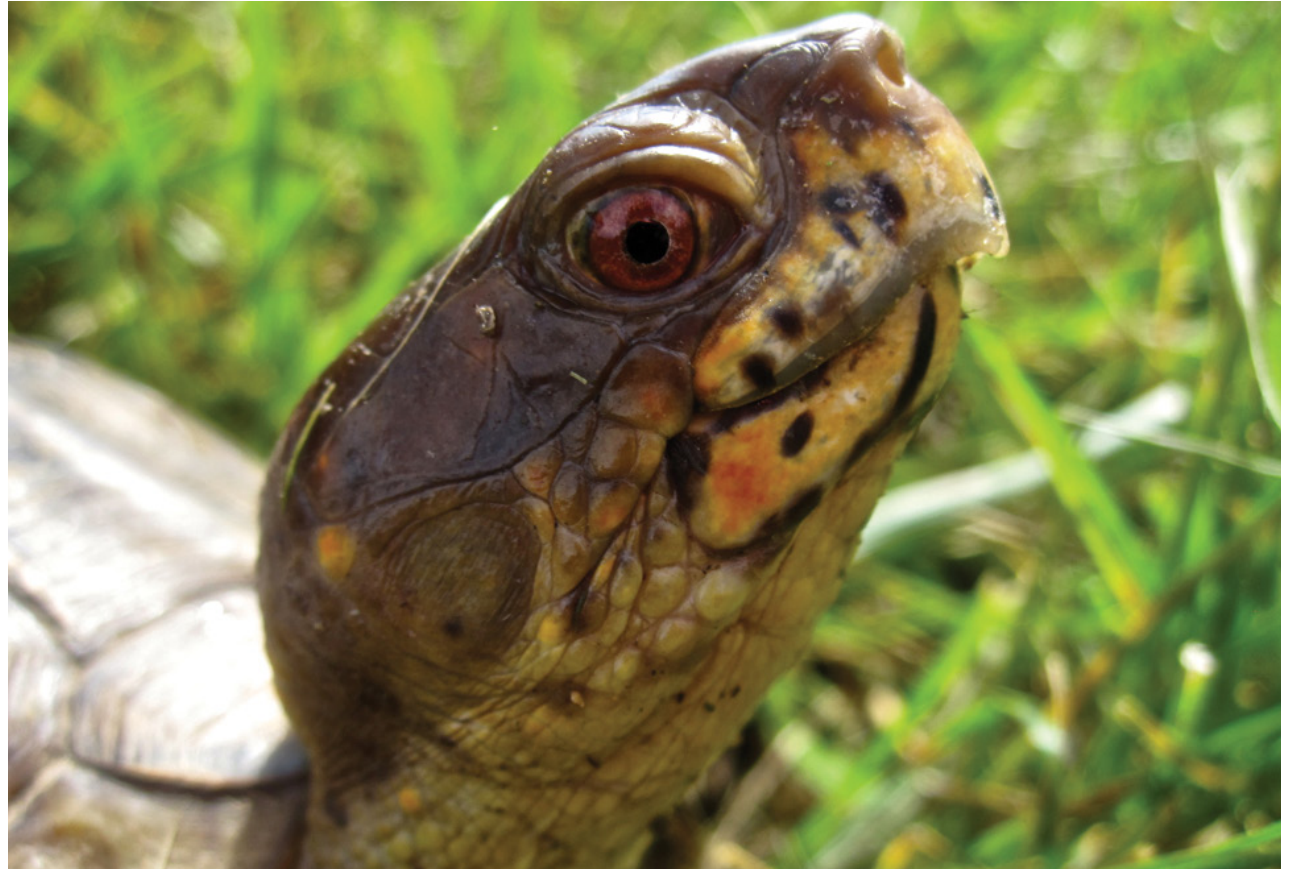
Western box turtle (Terrapene ornata)

The North American trade in turtles and tortoises almost exclusively involves live animals, although there is some trade in shells and other curios; meat, in the case of Der matemys ; and an unquantified trade in medicinal preparations containing turtle parts and derivatives. In the case of live specimens, most of these species are readily identifiable by their markings and other physical features. The attractive coloration of species such as C. guttata and M. terrapin is part of their desirability as pets. Therefore, identification of specimens in trade to species should not