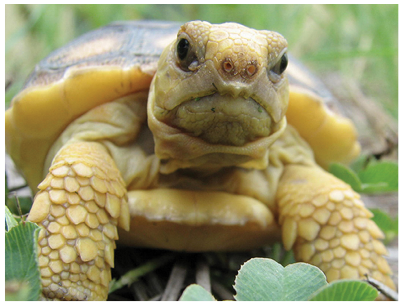
Gopher tortoise ( Gopherus polyphemus )

and to facilitate the recovery of threatened, endangered or extirpated species (Environment Canada 2013). The status of species of concern is based on assessments provided by the Committee on the Status of Endangered Wildlife in Canada (COSEWIC). COSEWIC is a committee of experts that determines the Canadian national status of native wildlife (including animals, plants, mosses and lichens) that may be at risk of extinction or extirpation. COSEWIC assessments incorporate science, and Aboriginal and community knowledge. The Committee meets on an annual basis (COSEWIC 2009).