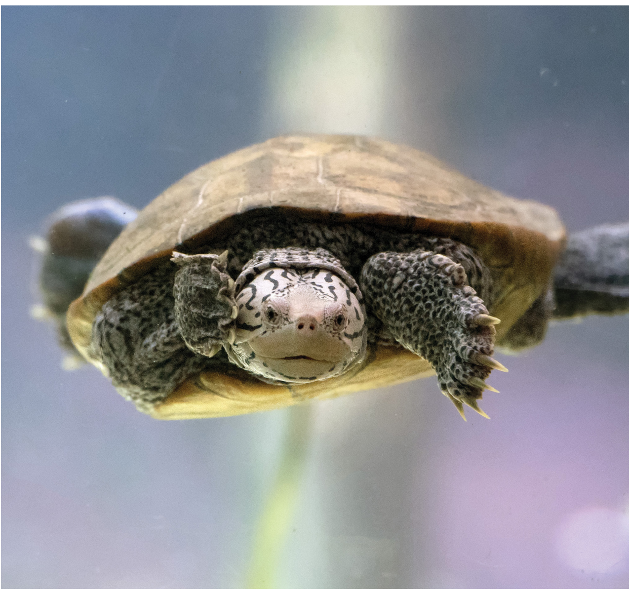
Diamondback terrapin (Malaclemys terrapin)

under the ESA. The combination of state and federal laws, as well as conditions imposed by State or other authorities, means it is illegal in the United States to collect, commercially breed, or trade these species in most circumstances. It is possible, however, for qualified members of the public to adopt Gopherus tortoises that have been rescued and cannot be returned to the wild. These adoptions are made on the conditions that the specimens be kept strictly confined to the owner's premises, and not be bred or traded (van Dijk, pers. obs).