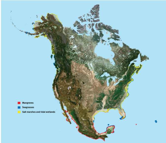
Salt marshes, tidal wetlands, seagrasses and mangroves are distributed around North America

Over the past eight years, scientists and policy-makers have increasingly focused on the impressive ability of coastal marine ecosystems to sequester, store and, when disturbed, even emit carbon. In 2009, coastal ecosystem carbon—the carbon captured and stored in salt marshes, tidal wetlands, seagrasses and mangroves—was first grouped under the term “blue carbon” in a United Nations Environment Programme (UNEP) report.